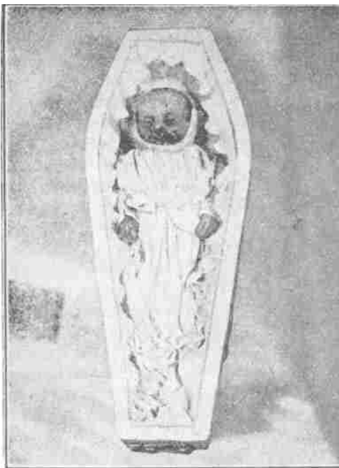
ERNEST VICTOR CHARLES CHEESEMAN

When syphilis results from vaccination, it is the usual claim of the doctors, that the mother must surely have syphilis and certainly communicated it to the child. In Wales when 4,000 infants were found to be syphilitic after their vaccinations, all the parents were examined by the doctors in an effort to lay the blame on them, but the parents were found to be free from syphilis.